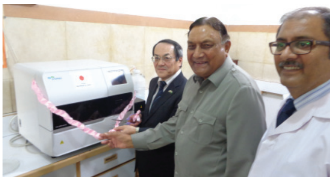
Ribbon Cutting of the Medical Equipment for Blood-Related Diseases to Fatimid Foundation from the Government of Japan

The Government of Japan extended a grant of US$83,755 for the provision of a coagulation analyzer, a cell separator and two medical freezers under its Grant Assistance for Grassroots Human Security Projects (GGP) scheme. The equipment will allow the diagnosis and treatment services for the patients of blood-related diseases to significantly improve not only at the Karachi clinic but also at other Fatimid clinics in rural Sindh.